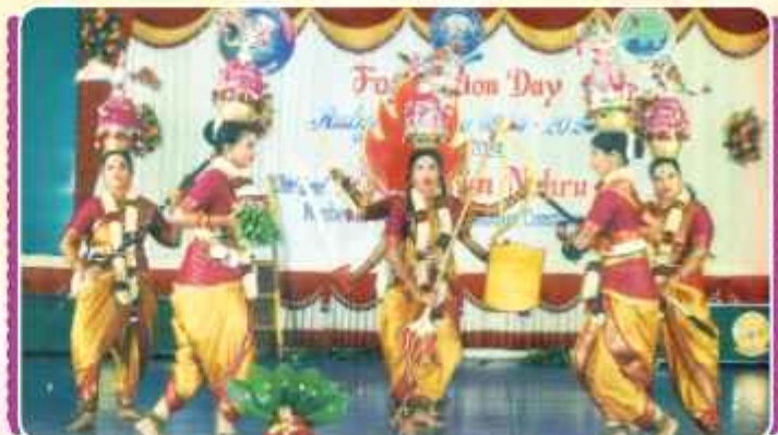
Grace in Tradition: Students' Exquisite Karagam Dance Performance on Ruby Jubilee Day