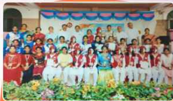
Pink House of Biotechnology & Microbiology bags Overall Runners-up Trophy in March Past