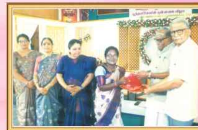
Token of Gratitude: Honouring the Chief Guest with a Memento on Hostel Day