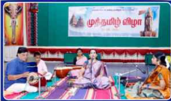
Easi Tamil isn't just spoken, it's sung with pride and power.