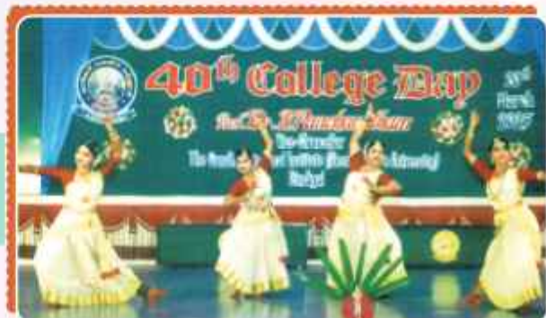
Rhythmic Celebration: Students' Dance Performance Adds Sparkle to College Day