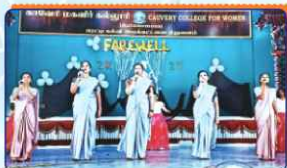
Juniors present melodious farewell song, expressing heartfelt appreciation and respect for seniors