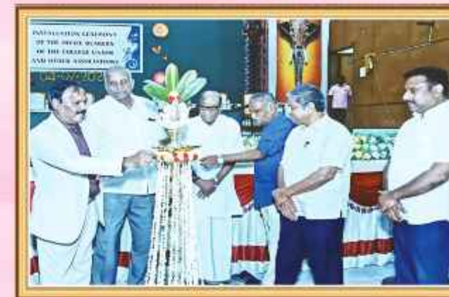
The Ceremony commenced with the chief guest lighting