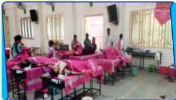
Leo Club Leads Life-Saving Blood Drive!