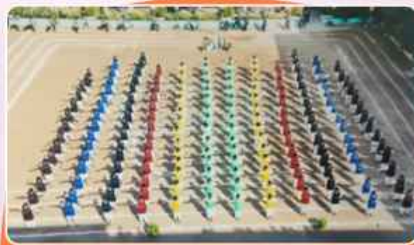
Drill Formation by Students Displays Discipline, Coordination, and Team Spirit in Action!