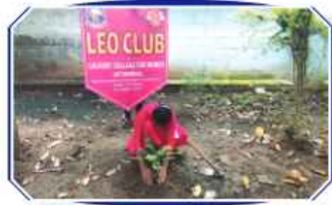
One drop can save a life. We donated hope.