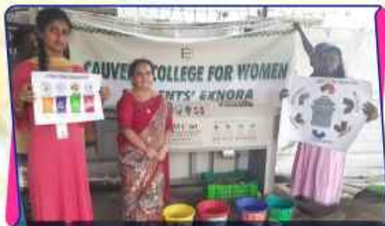
Solid Waste Management Drive: Students Embrace Clean Living for a Greener Tomorrow!