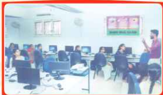
Excel in the Future – AI Tools and Techniques with K. Sabari Vel!