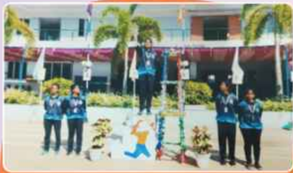
Olympic Torch Ignited by Champions, Kicking Off the Games in Glory!