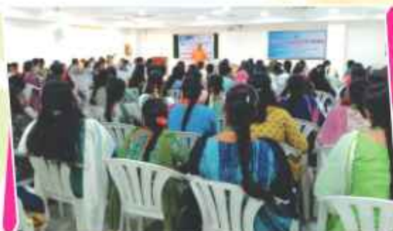
A program on Catalyst-Sowing seeds for startups jointly with EDII TN on 14.06.24.