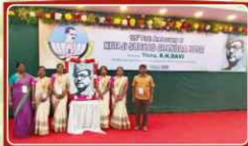
128th Birth Anniversary of Netaji Subhas Chandra Bose Celebration @ Bharathidasan University, Trichy (Invocation - Our College Choir Team)