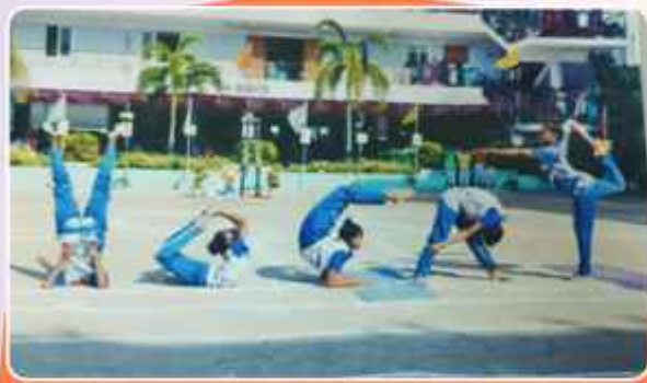
Yoga Formation: Harmony of Body, Mind, and Soul in Perfect Balance!