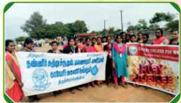
Palm to the Earth, Hope to the Future – Kaviri Riverbank Initiative