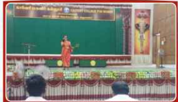
FOLK SONG SOLO