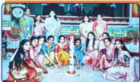
Students joyfully lit lamps, their faces aglow with happiness and excitement