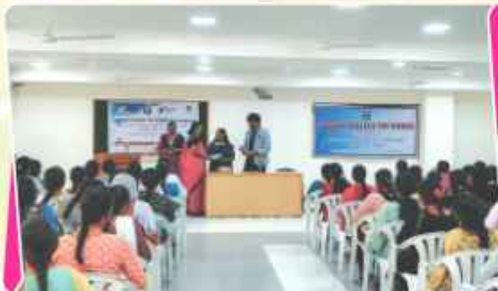
A program on Solving analysis of IDEa and Development of Business plan on 10.02.2025.