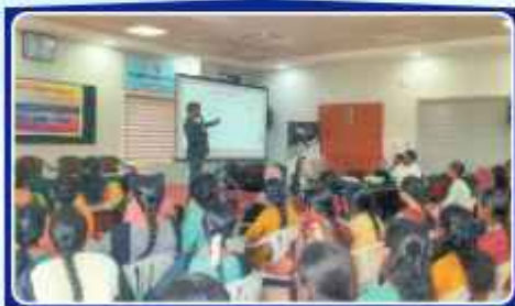
Skill Development Programme on "DIGITAL MARKETING"