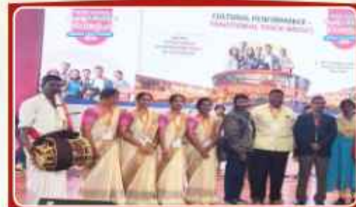
Cultural Performances @ Bharat Mandapam, New Delhi