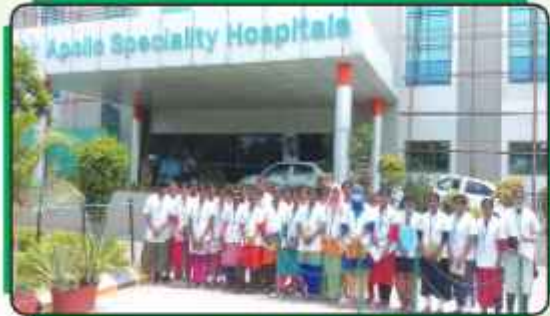
Industrial Visit to Apollo Speciality Hospitals, Trichy