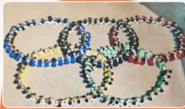
Olympic Circle Formation: United in Spirit, Five Continents, One World!