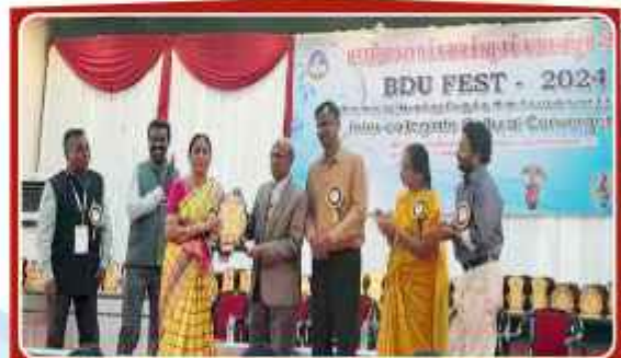
Madam Principal Receiving 40 Years of Excellence Award