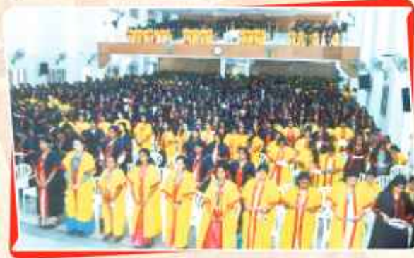
The Pride of Cauvery – Rank Holders Who Rose to the Top!