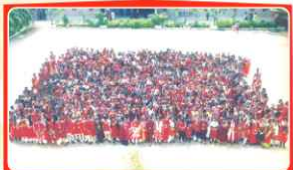
Four Decades, One Legacy – Captured in Celebration!