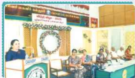
Words of Wisdom: Chief Guest Addresses the Gathering