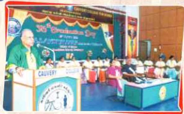
Bound by Promise, Driven by Purpose – Oath of the Cauvery Graduates!