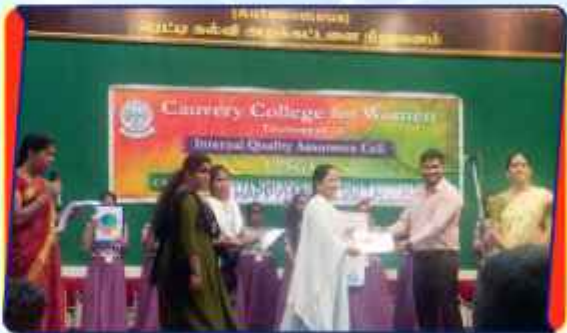
Tamil Studies, Tanishq Host Independence Day Festivities