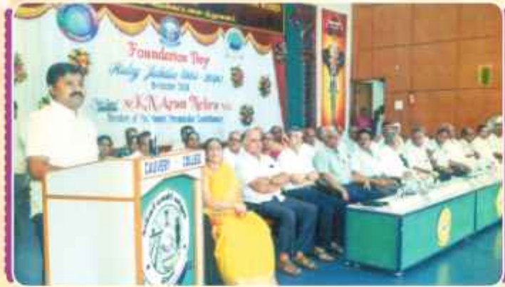
Marking 40 Years: Mr. Arun Nehru, MP, Graces Ruby Jubilee Celebration with His Address