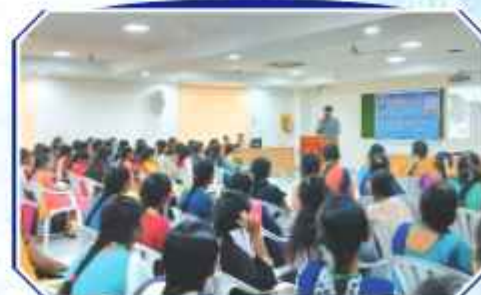
Technology and Entrepreneurship