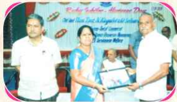
With Deep Respect and Gratitude – Governing Council Honours Our Esteemed Guest