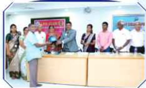
Tiny saplings, mighty futures, growing with every Leo heart.