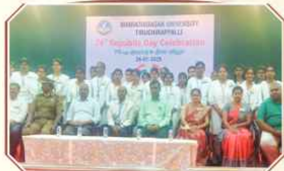
NSS Volunteers Shine at Republic Day Celebration!