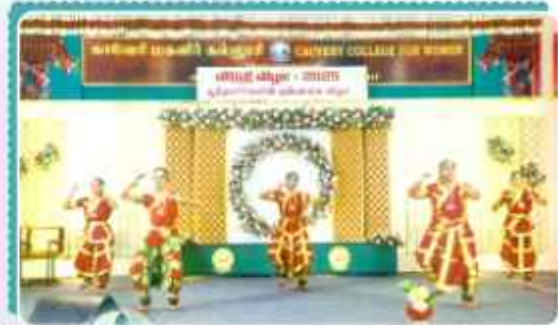
Rhythms of Joy: Students' Mesmerizing Dance Performance on Hostel Day