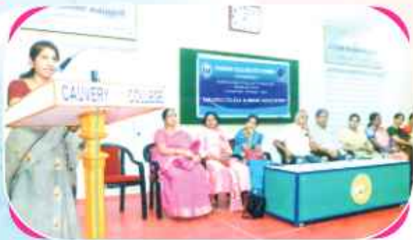
Principal Inspires Graduates with Wisdom