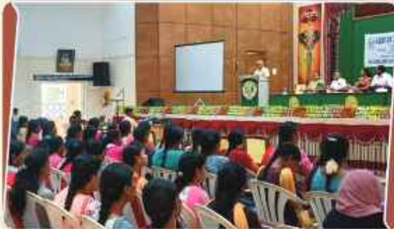
Mind Club Inauguration: A Step Towards Empowering Social Workers with Vision and Compassion!