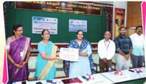
Collaboration of EDC with TN RISE Women Council, Government of Tamilnadu