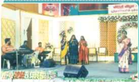
Inspiring Moments: Chief Guest's Captivating Performance on Hostel Day