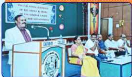
Chief Guest delivers inspiring, wisdom-filled address. Stage set with encouragement and wisdom