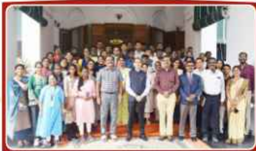
Governor Thiru. R.N. RAVI @ Chennai