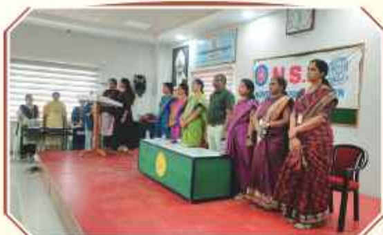
NSS Special Camp 2025 Grandly Inaugurated!