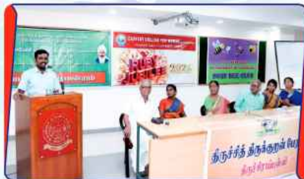
Sixteen Kavangam Lights Up Tamil Scholarship