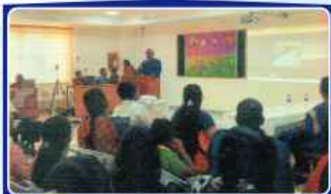
Dynamic of Emerging Buisness Innovation and Trends - Academia Industrial Role "DEBIT AIR 2025"