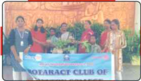
Rotaract Empowers Kammarasanpetti with Herbal Saplings!