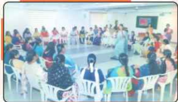
Graphing Success Stories with Our Proud Alumna!