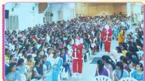
Santa's Grand Arrival: Spreading Cheer at Triple Fiesta