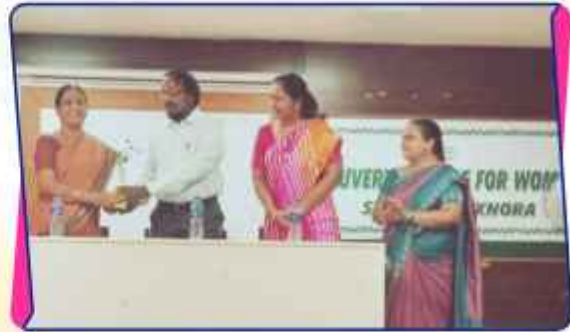
ExNoRa 26th Installation 2024: Youth Inspired to Grow Green from Campus to Nation!