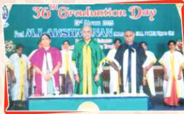
Cauvery's Class of Legacy: Celebrating 36 Glorious Graduations!