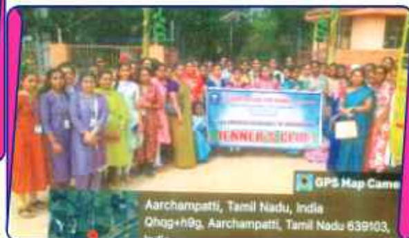
Students Explore Banana Research at Thogaimalai Centre