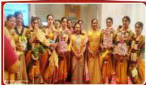
Inner Wheel Club & Hotel Court Yard