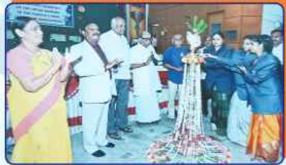
Student leaders' light ceremonial lamp. Auspicious start with lamp lighting