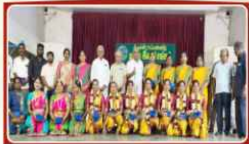
TAMIL ISAI SANGAM @ K.A.P.V. School, Trichy