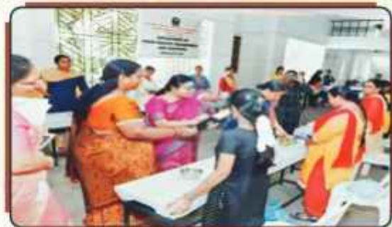
Celebrating Nutrition Week with Fireless Cookery Challenge!