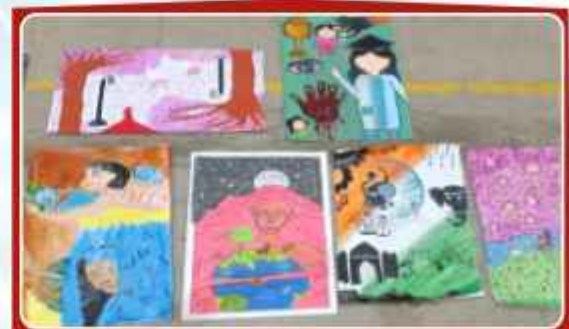
Brushes & Beyond: Art That Speaks!