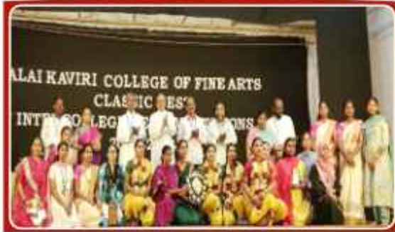
Classic FE(A) ST 2K24 - Overall Runner