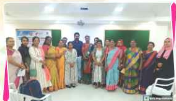
A program on Solving analysis of IDEa and Development of Business plan on 10.02.2025.