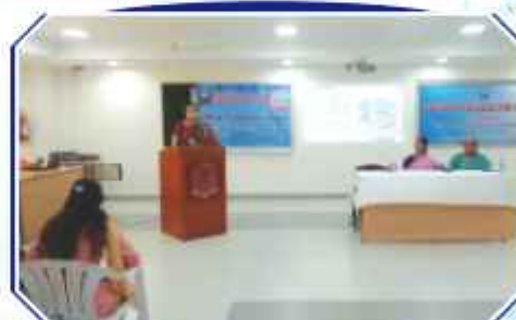
Artificial Intelligence a Threat to Software Developers