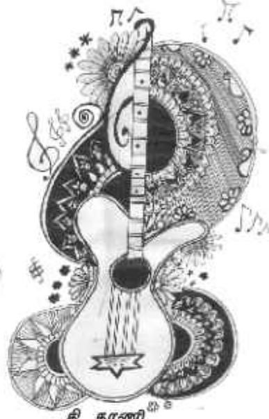
தி. துணி இளங்கலை இரண்டாமாண்டு ஊட்டச்சத்து மற்றும் உணவுமுறையியல்