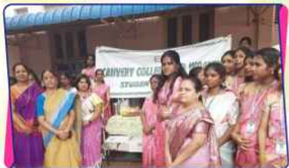
Clean & Green Poster Contest 2024: Students Blend Art with Environmental Heart!