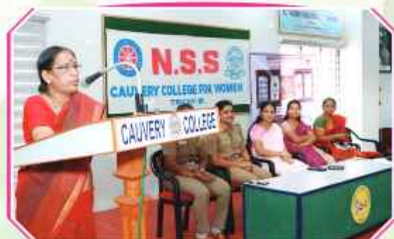
Empowering Safety Through KaavalUthavi App Awareness