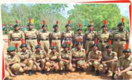
19 CADETS of Cauvery College for Women, Autonomous attended Annual Training Camp at PMIST, Vallam from 19.10.2024 to 28.10.2024