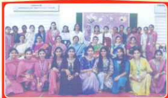
Reflecting on a Year of Hard Work, Teamwork, and Success – Busy Bee Club Valediction!