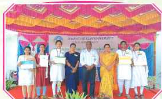
United in Patriotism: NSS Marks 78th Independence