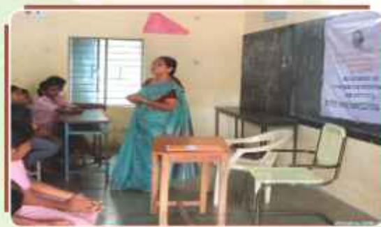
Adolescent Nutrition Tips for Lifelong Healthy Habits!