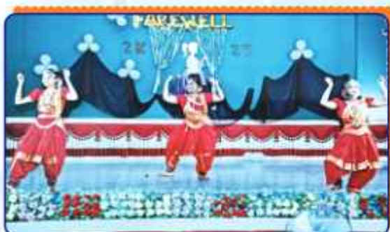
Juniors perform heartfelt farewell dance, honoring seniors with gratitude and admiration