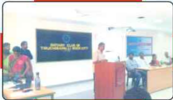
Cauvery College Hosts Exceptional Top Notcher' 24 Event!