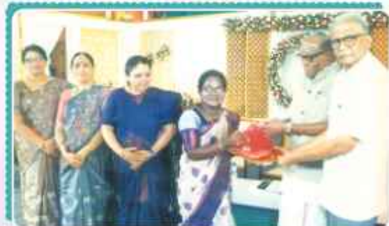
Token of Gratitude: Honouring the Chief Guest with a Memento on Hostel Day