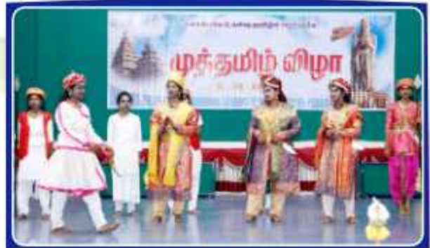
The curtain rises, and so does our language - Nadaga Tamil shines through our students.