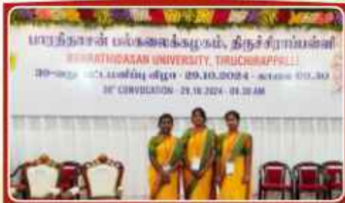
39th Convocation of Bharathidasan University (Invocation - Our College Choir Team)