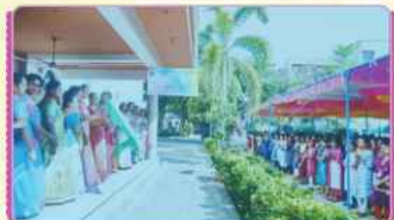
English Marathon 3.0: A Weeklong Linguistic Sprint Toward Excellence for First- and Second-Year Students