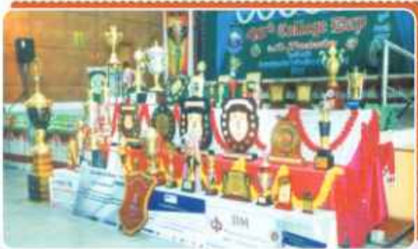
Celebrating Excellence: 40th College Day Highlights Student Achievements with Trophy Triumphs