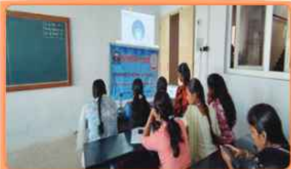
Powering the Future: AI with Amazon – A Virtual Insight!