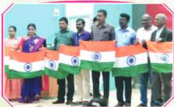
Together We Rise Against the Drug Menace