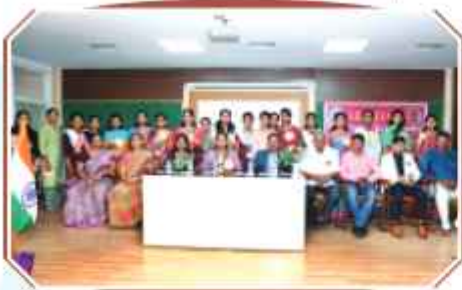
The pride grows stronger — Leo Club Installation with Lions Rock City!