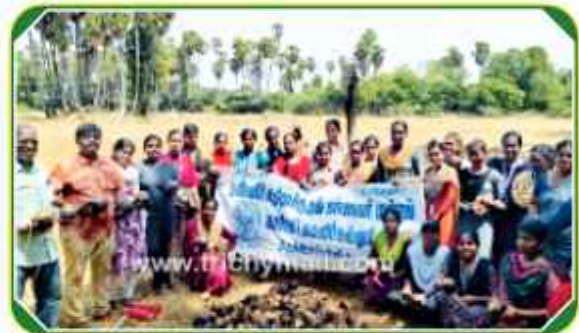
Nature's Legacy Begins Here – 21st Sept, Palm Seeds @ Olaiur