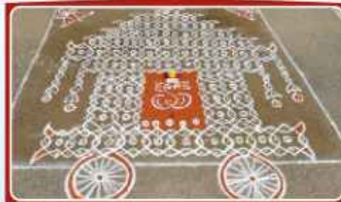
Dots, curves & creativity : The Kolam Chronicles