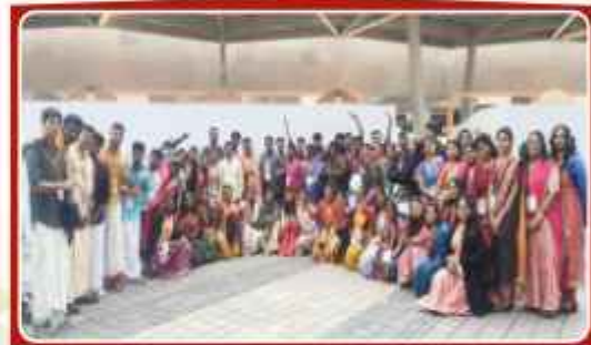
Viksit Bharat 2K25 in Bharat Mandapam