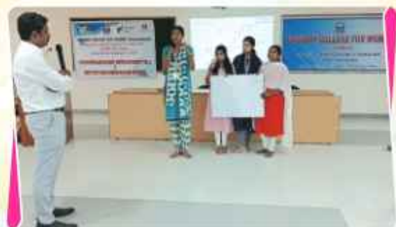
Workshop on Blue Ocean Strategy on Development of Ideas collaborated with Madras Christian College, Chennai