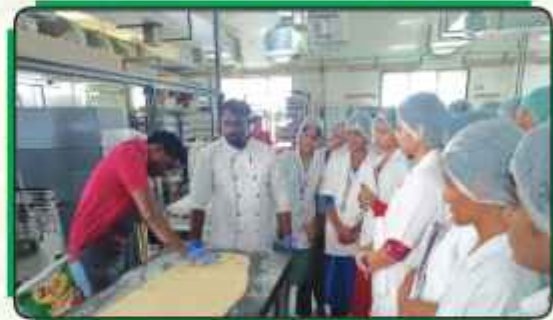
Industrial Visit to Aswins Sweets, Perambalur.