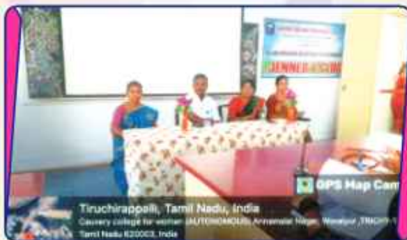
Master Organic Farming with Cutting-Edge Techniques Today!