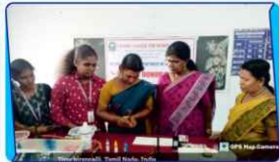
Blood Grouping Drive Empowers Health Awareness!