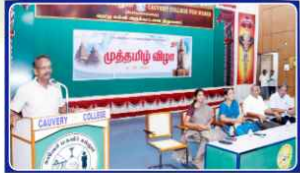
Reviving Roots, Rekindling Pride, Iyal Tamil Inspires!