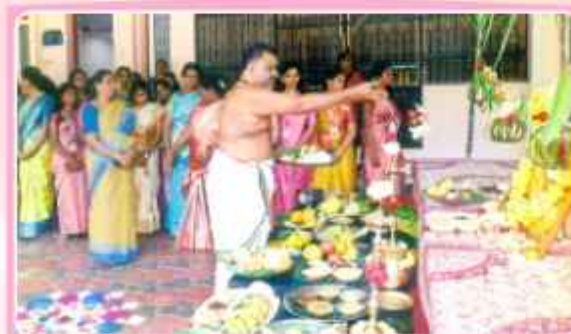
Divine Festivities: Pongal Celebrated with Pooja and Prayers