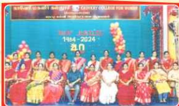
Faces of the Past, Present, and Future – All in One Frame!