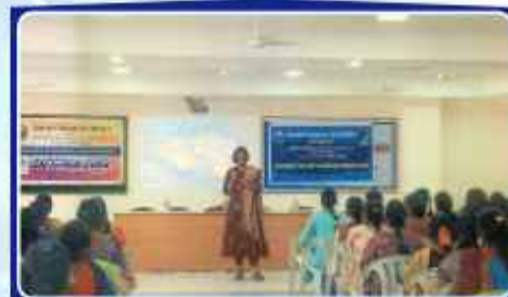
Career Guidance Programme