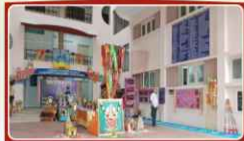
NAAC IV Cycle Visit