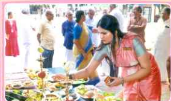
Embracing Joy and Tradition: Our College Pongal Celebration