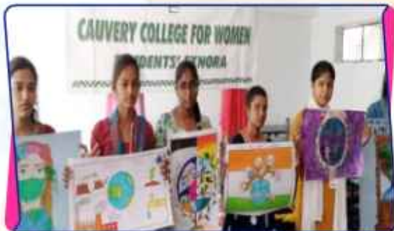
Poster Power 2024: Students Paint a Greener Future with Creativity and Consciousness!