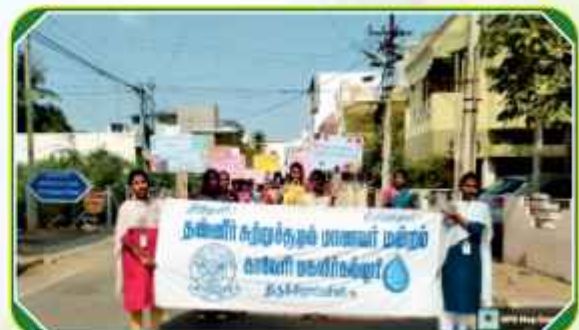
Say No to Plastic Bags, Yes to Wellness – Awareness Rally | 28.09.2024