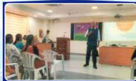
The Changing Landscape on Learning in the Field of Accounting and Finance