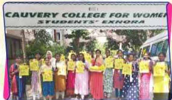
Meendum Manjappai: ExNoRa Leads the Way to a Plastic-Free, Greener Tomorrow!