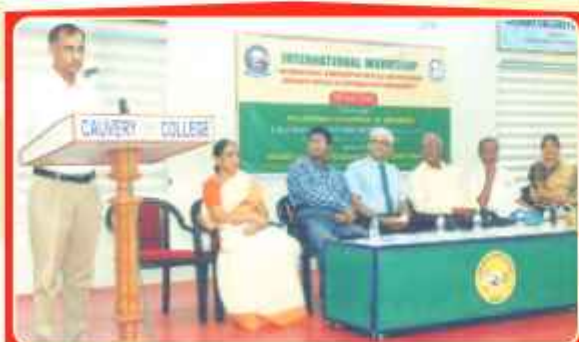
Commerce, Management, Research, Excellence – All in One Workshop!