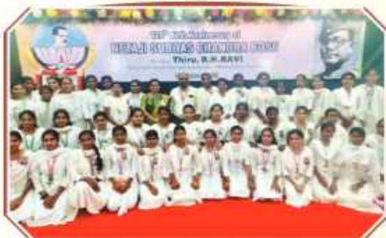
Saluting Netaji's Legacy with NSS Pride!