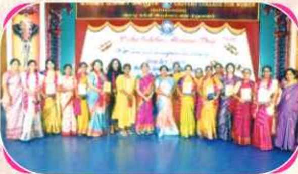
Proud Alumnae, Honoured by Icons