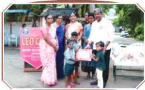
Freedom in our hearts, flags in the sky, and hope in little hands!