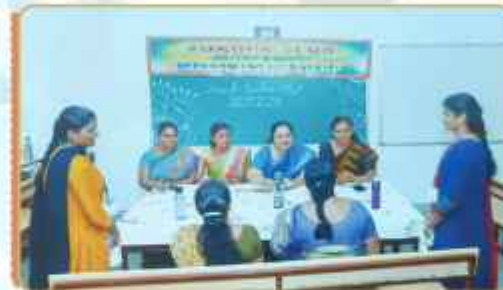
Bridging Minds & Building Futures – A Meaningful Dialogue Between Parents and Professors!