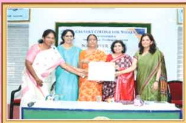
Accredited with Excellence: Cauvery College Earns NAAC 'A+' in IV Cycle!