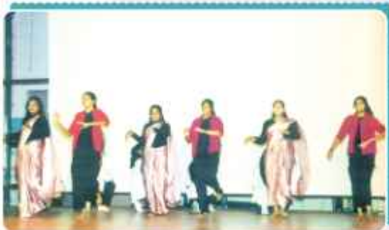
Energetic Beats: Students' Vibrant Dance Performance on Hostel Day