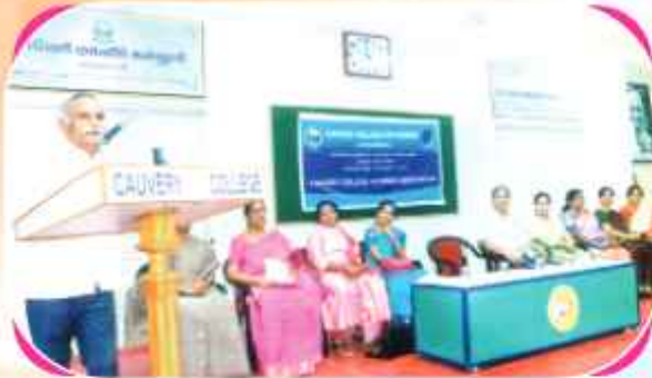
Secretary Speaks: Pride, Purpose, Progress