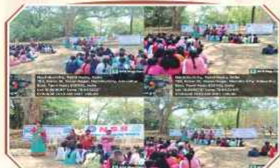
Glimpses of NSS Special Camp