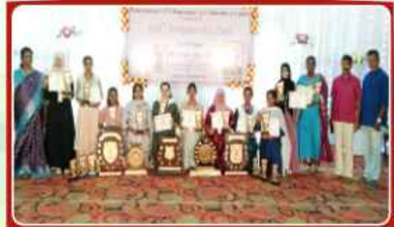
Seeras' 2K24 Fest - Overall Winner