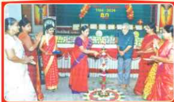
Ruby Jubilee – Lighting the Flame of Pride and Progress!