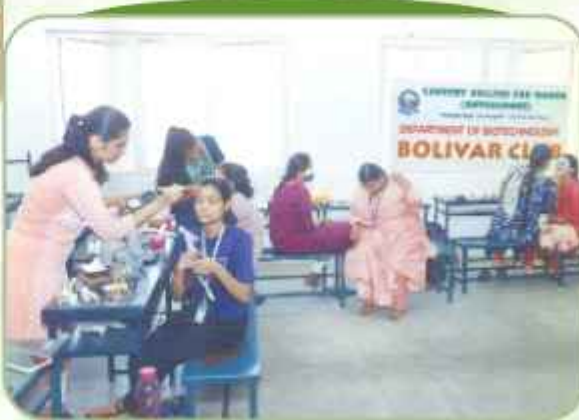
Ruby Jubilee Sparks Healthy Inter-Departmental Competition!