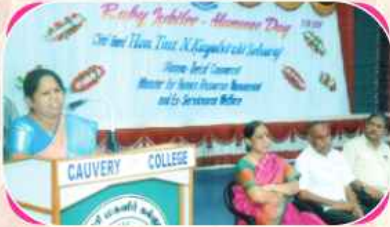
A Legacy Honored, A Future Inspired – Hon. Minister Tmt. N. Kalyavizhi Selvaraj at the Ruby Jubilee Celebration