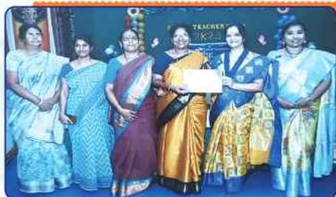
Best Teachers awarded: appreciation certificates given by Inner Wheel Club