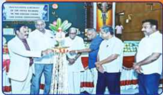
The ceremony commenced with the chief guest lighting