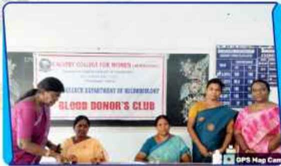
Health First: Haemoglobin Checked; Awareness Raised!