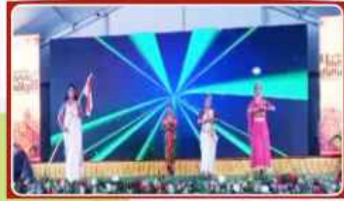
Book Fair Exhibition @ St. John's Vestry School, Trichy