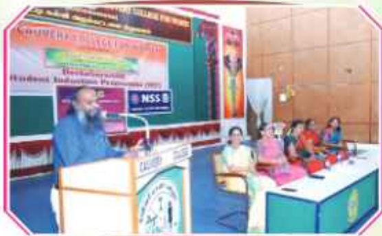
First-Year Students Introduced to NSS Journey