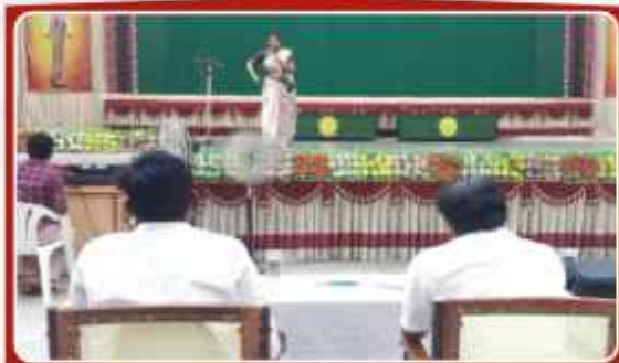
LIGHT VOCAL SOLO