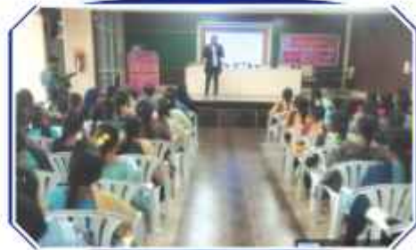
Leo Week 2025: Celebrating culture, ensuring safety, inspiring service!