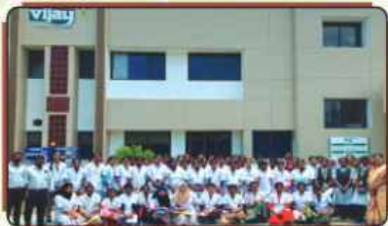
Industrial Visit to Vijay milk, Peramangalam.