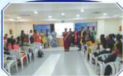
Future Horizons: The Transformative Impact of Generative AI on Data Science