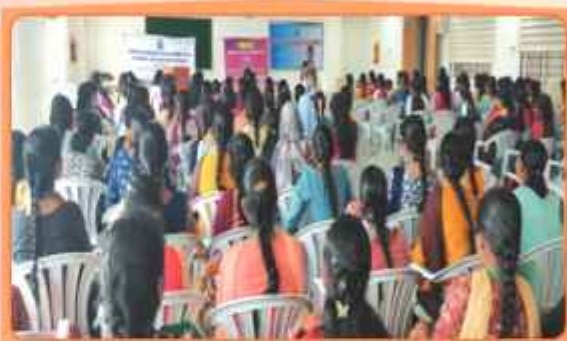
Kickstarting Careers, One Connection at a Time! Linked in Kickstarter Face PrepFocus