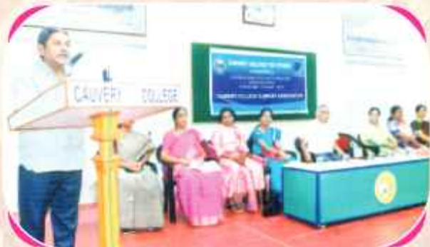
President's Address: Pride and Progress