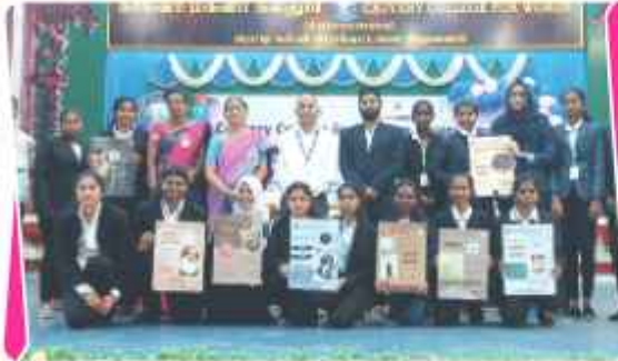
Brand launch of startups jointly with Startup TN, Government of Tamilnadu on 22.03.2025