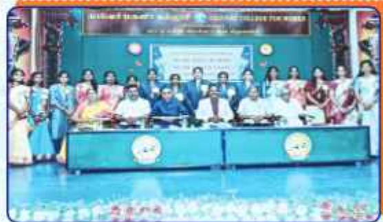
Office bearers and dignitaries gathered. A momentous occasion was marked