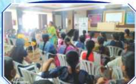
Mental Health- How to Hack your happy Hormones