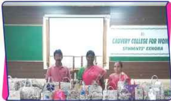
Wealth Out of Waste 2024: First-Year Students Turn Trash to Treasure with Creative Paper Bag Designs!