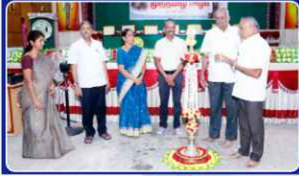
The lamp of Muthamizh, the pride of Tamils!