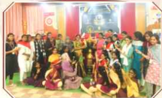
CHAMFEST Champions: Talent, Triumph, Glory Unleashed!