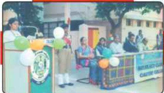
District Governor Rtn. Subramani Celebrates Republic Day