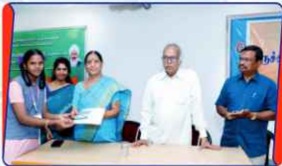
Tamil Studies, Thirukkural Peraval Host Inter School Essay Competition