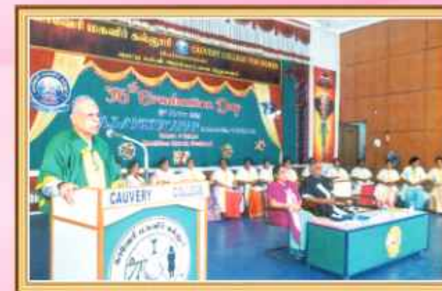
Voices of Vision – Chief Guest's Call to the Future Graduates!