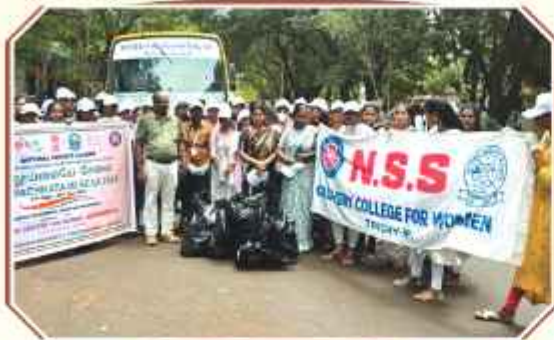
From Waste to Wonder — Cleaning Khajamalai Campus with Purpose!