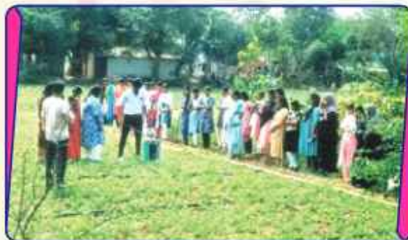
Hands-On Learning Experience at Thalarkalai Farm Visit