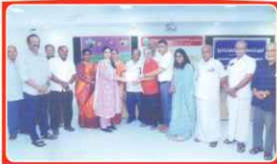
58th A.D. Shroff Memorial Inter-Collegiate Elocution contest