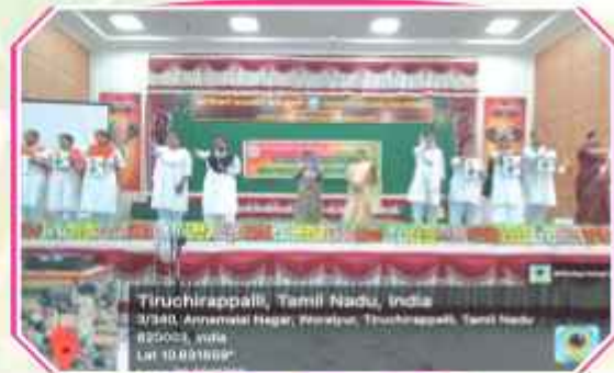
Together We Rise Against the Drug Menace