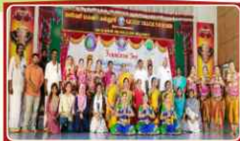
40th FOUNDATION DAY was celebrated in presence of Mr. K.N. ARUN NEHRU M.S., Member of Parliament, Perambalur constituency