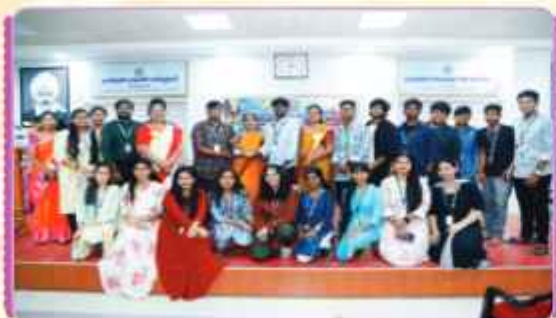
FEZ' CAU 2025: Bishop Heber College clinches Overall Championship, celebrating victory