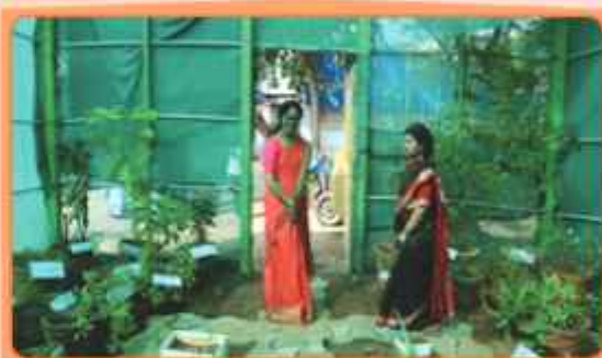
A Walk-Through Wellness : Herbal Garden Welcomes NAAC Delegates!

Accredited with Excellence: Cauvery College Earns NAAC 'A+' in IV Cycle!