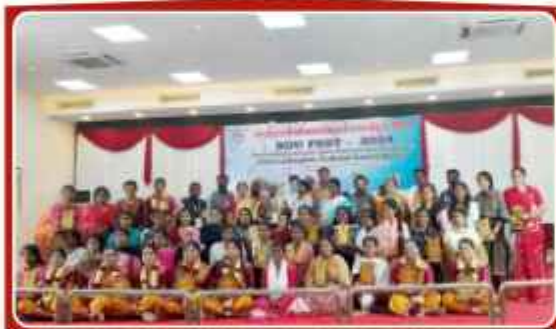
BDU Fest 2K24 - Overall Runner